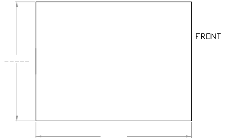
PASSENGER SIDE VIEW